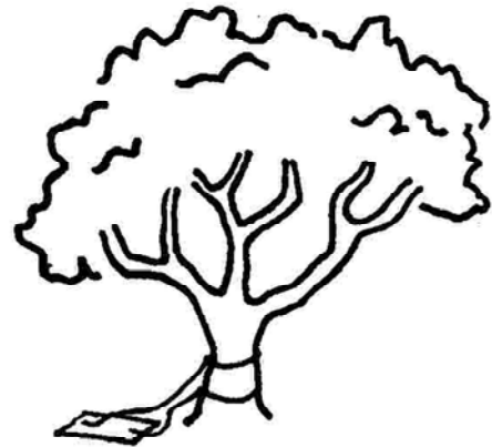
as designed by engineering