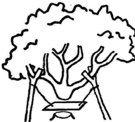
as maintenance installed it