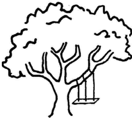
what management approved