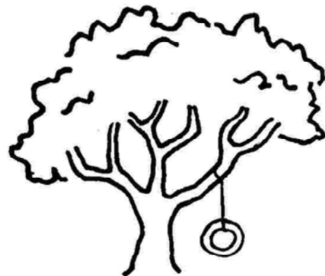
what the customer wanted