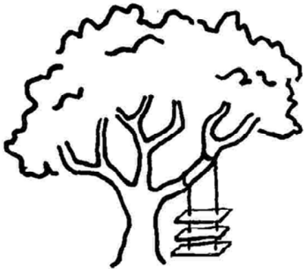
what marketing suggested